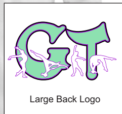
Large Back Logo